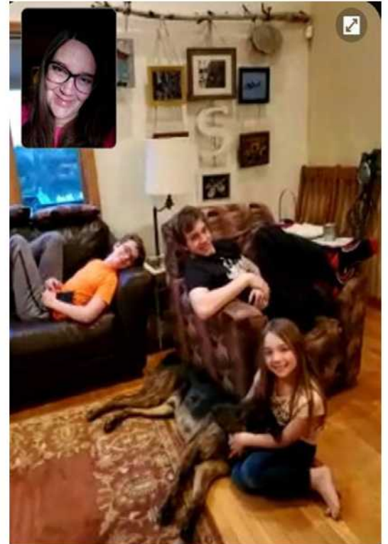
FACETIMING WITH THE KIDS DURING THE SEPARATION