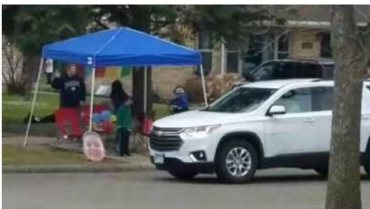
DRIVE BY BIRTHDAY PARTIES