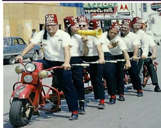
GRAFTON CYCLEERS A FEW YEARS PAST, THE BIKE IS STILL AROUND JUST NEED A FEW MORE CYCLEERS TO JOIN. RED SOCKS REQUIRED.