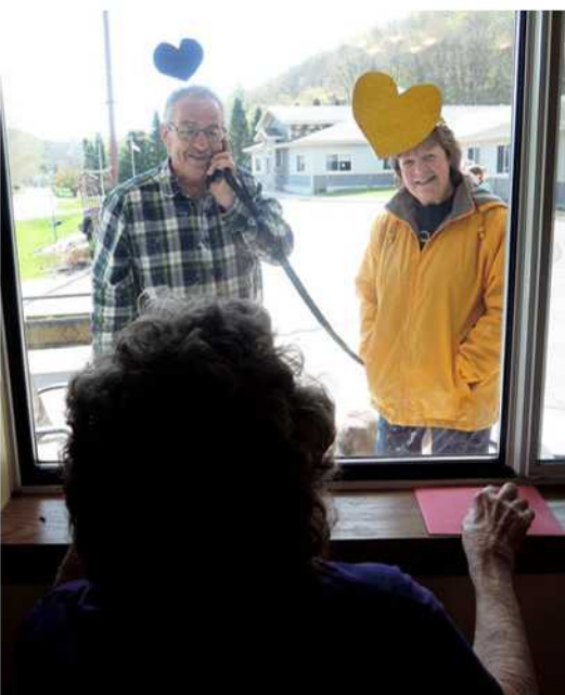
OUR POTENTATE'S STEPMOM TURNED 95, DUE TO SOCIAL DISTANCING THIS IS HOW HER HUSBAND AND NIECE HAD TO CELEBRATE WITH HER