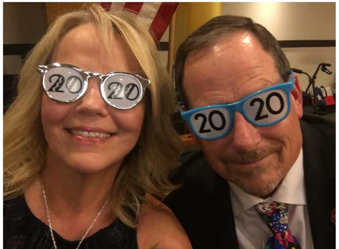
WE SURE DIDN'T "SEE" 2020 LOOKING LIKE THIS!