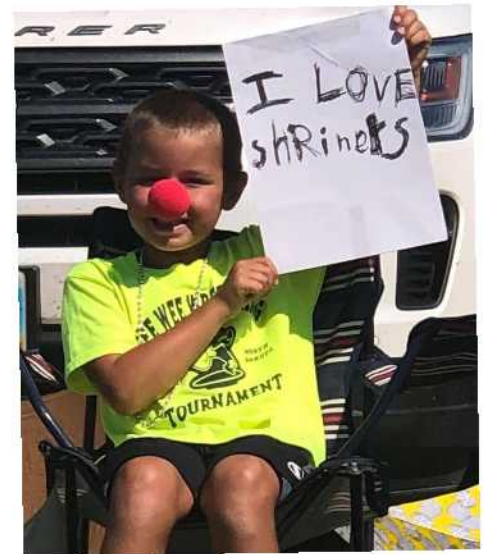
ENJOYING ONE OF THE PARADES

Have a great Fall, enjoy the beautiful changes that the season bestows upon us.