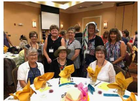
KEM LADIES FROM DEVILS LAKE