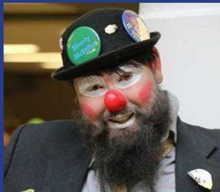
CLOWN AT FOOTBALL GAME