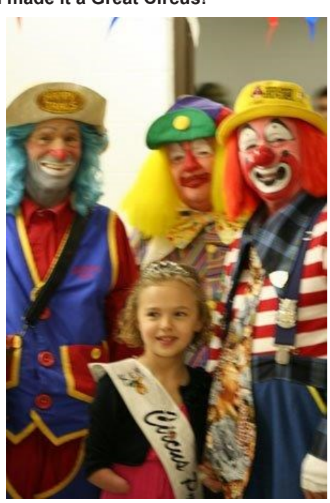
Circus Princess at the Minot Shine Circus with the Minot Merrymen.

Grand Forks, ND Permit No. 14 \mathsf{DAID} U.S. POSTAGE Non-Profit Org.