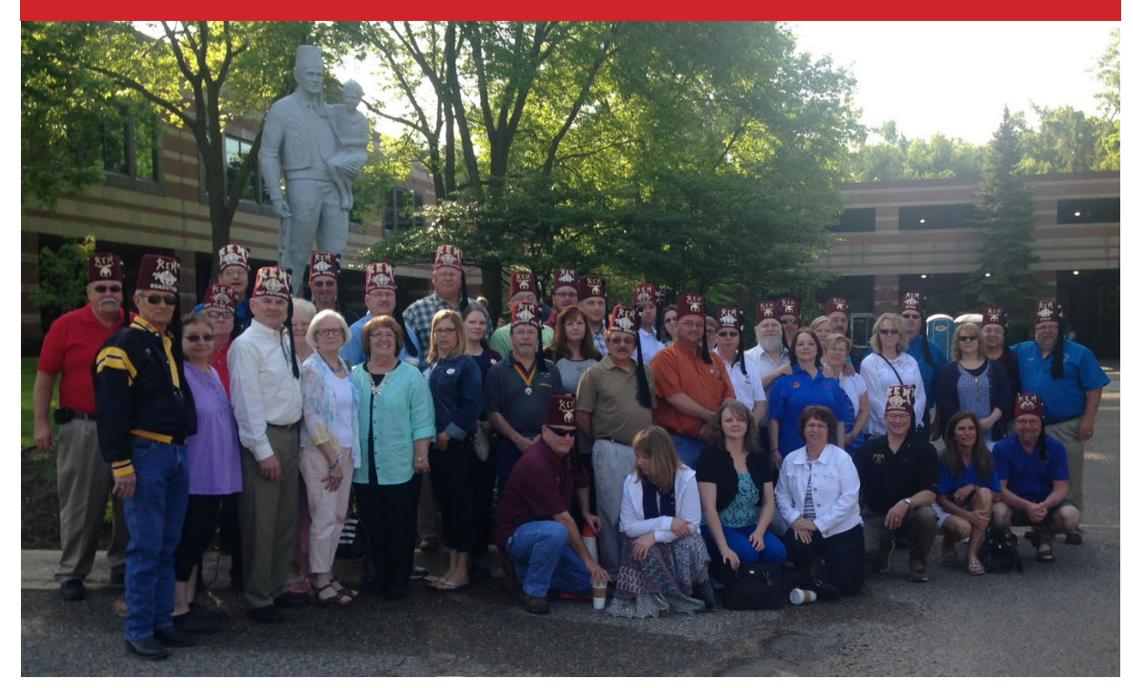
KEM SHRINE HAVING A GREAT TIME AT TWIN CITIES HOSPITAL