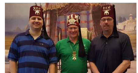
NEW SHRINERS FROM JUNE CEREMONIAL