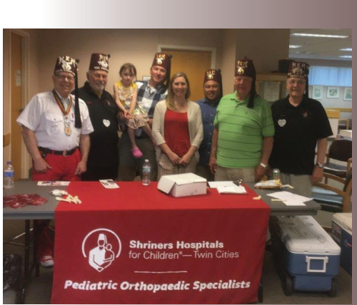
MINOT SCREENING CLINIC HELD JUNE 12, 2017.