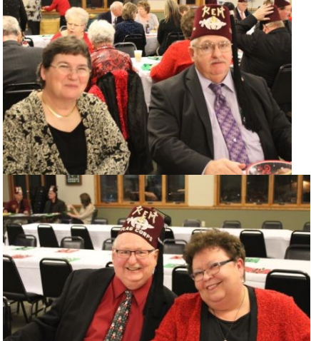
Devils Lake Christmas Party