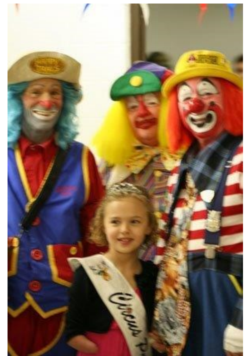
Circus Princess at the Minot Shine Circus with the Minot Merryman.