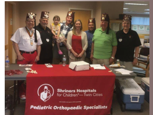
MINOT SCREENING CLINIC HELD JUNE 12, 2017.